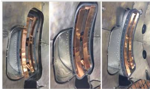
Figure 1. The ICRH antenna in the vacuum vessel of W7-X for three radial positions.

The superconducting stellarator Wendelstein 7-X (W7-X) at the Max-Planck-Institute in Greifswald has been operational since 2015. One of the main goals of W7-X is to demonstrate efficient confinement of fast ions at high plasma densities. To achieve this, W7-X was specifically optimized to handle volume averaged beta values of up to 5%, which corresponds to plasma densities above 10^{20} \text{ m}^{-3} . To simulate the behaviour of alpha particles in a future stellarator reactor, a population of fast ions with energies ranging from 80-100keV is required in the core of high-density plasmas in W7-X. A promising method to tackle this demanding task in W7-X is Ion Cyclotron Resonance Heating (ICRH), using minority heating of H in ^4\text{He} and D plasmas and the ^4\text{He} -( ^3\text{He} )-H or D-( ^3\text{He} )-H 3-ion scenario.